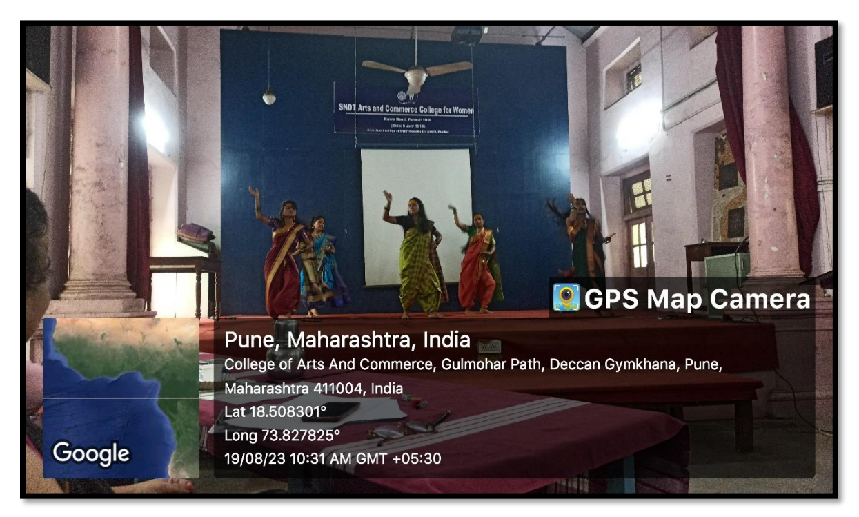
Folk Dance: Gondhal

SNDT Women's University organizes an annual Youth Festival, in which students from various colleges and institutes actively participate. To prepare for this event, our college conducted a selection round on 19th August 2023 for the Classical Solo and Folk Dance categories. During this selection round, students demonstrated great enthusiasm and competitive spirit. The selected students represented the college in the Youth Festival, where they showcased their talent and secured awards in their respective categories.