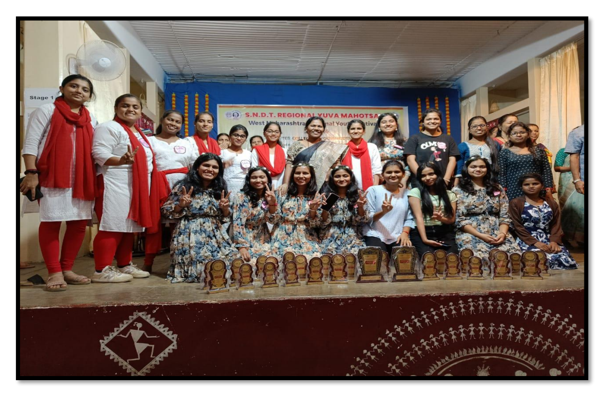
College won Overall Music Trophy in Grand finale of Yuva Mahotsav