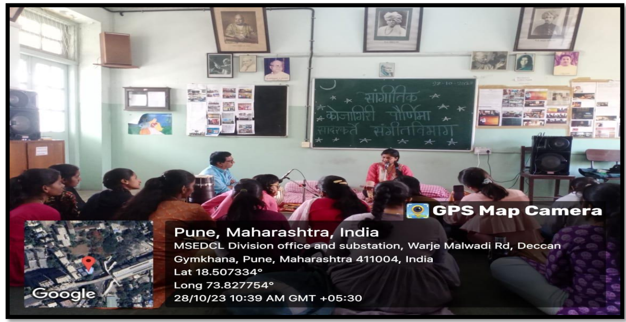
Kojagiri Pournima Program