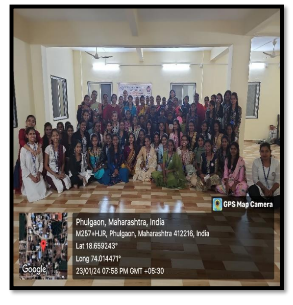
Haldi Kunku Ceremony for Female Villagers