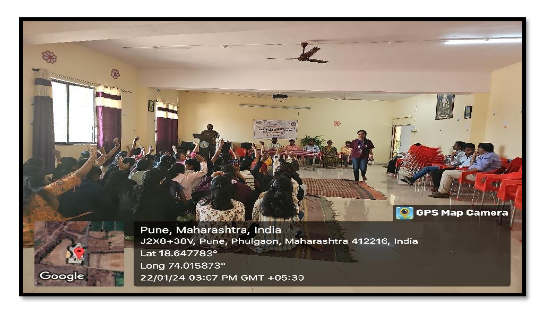
Cultural Performance by NSS Volunteer