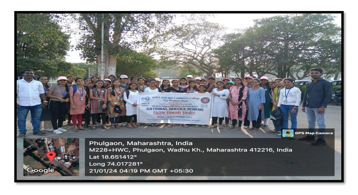
Street Play in Village