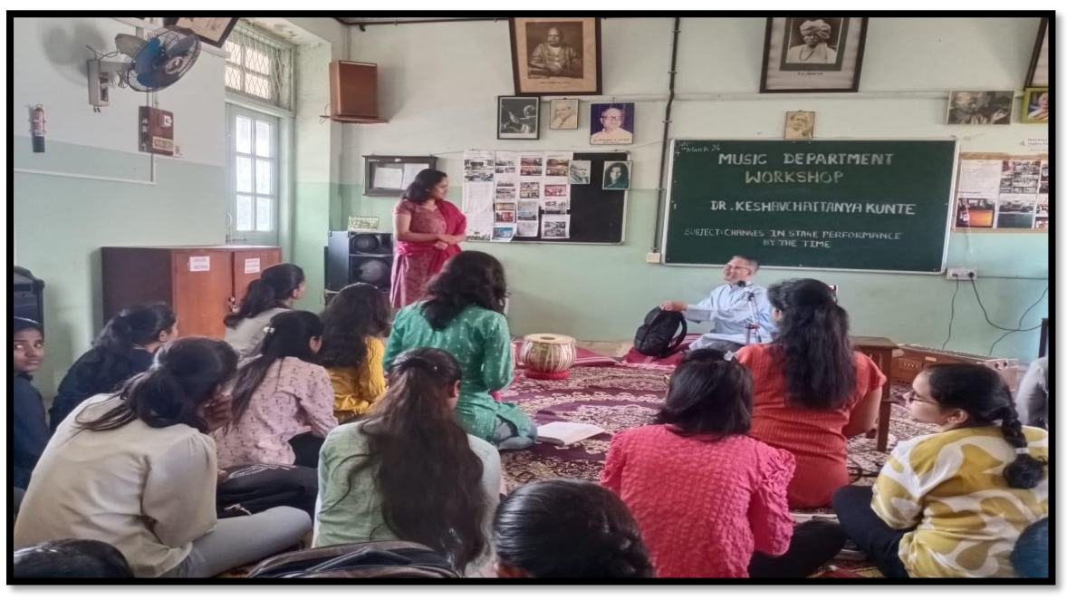
Raag Vichar Workshop